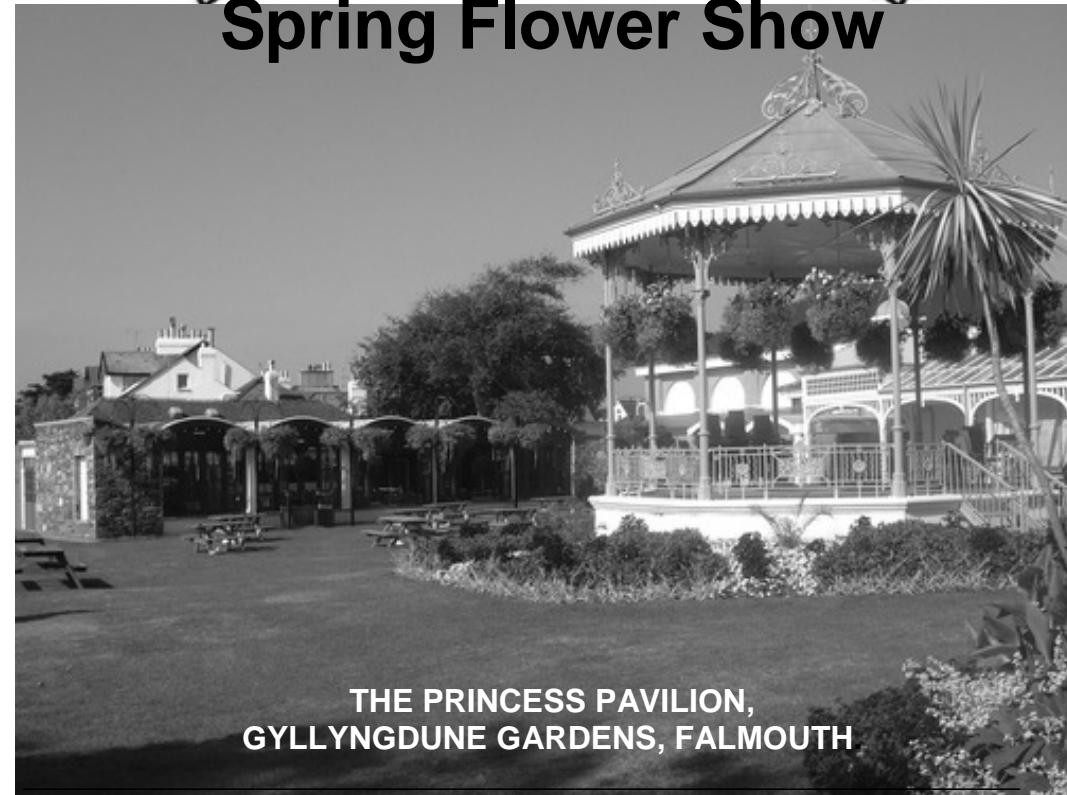
THE PRINCESS PAVILION, GYLLYNGDUNE GARDENS, FALMOUTH

SATURDAY 26th MARCH 2011 10 a.m. to 5.00 p.m. SUNDAY 27th MARCH 2011 10 a.m. to 4 p.m.